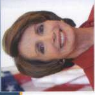
Representative Nancy Pelosi (D-CA) Ranking Member (1997-2000)