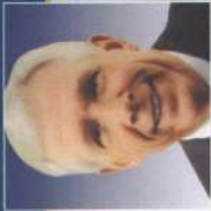
Representative Frank Wolf (R-VA) Ranking Member (2007-2008)