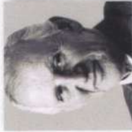
Representative Sid Yates (D-IL) Ranking Member (1995-1996)