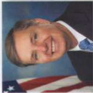
Senator Lindsey Graham (R-SC) Ranking Member (2011-present)