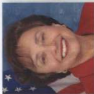
Representative Nita Lowey (D-NY) Ranking Member (2011-present; 2001-2006); Chair (2007-2010)