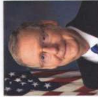
Senator Mitch McConnell (R-KY) Chair (2003-2006; 2001; 1995-2000); Ranking Member (2001-2002; 1993-1994)