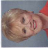
Representative Kay Granger (R-TX) Chair (2011-present); Ranking Member (2009-2010)